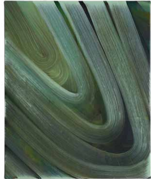
Chorus, 2016 Oil on canvas 61 x 51cm