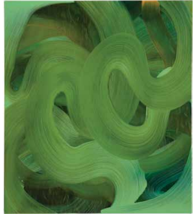
Soothed Grooves, 2017 Oil on canvas 92.5 x 81.5cm