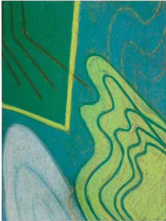
Formation 4, 2017 Pastel on paper 32 x 23.5cm