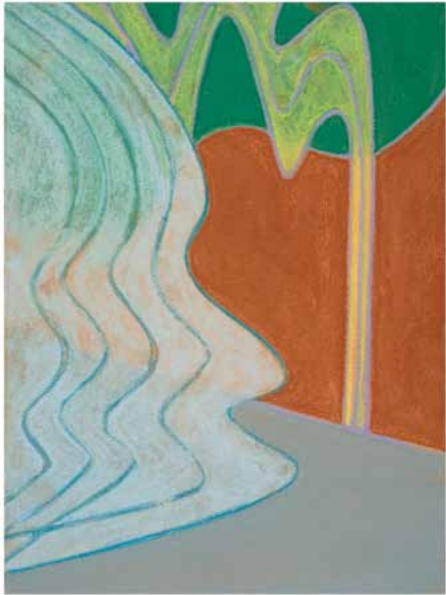
Formation 1, 2017 Pastel on paper 32 x 23.5cm