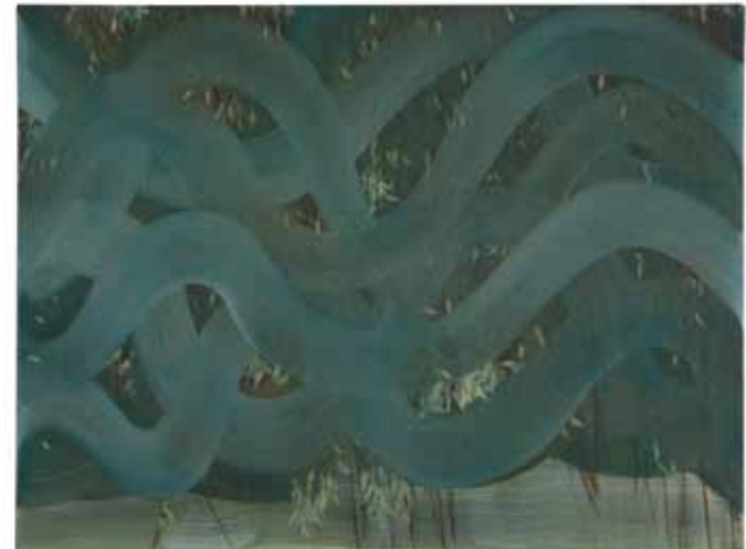
Weeping Willow, 2015 Oil on canvas 45 x 60cm