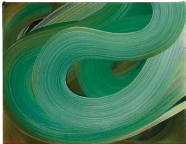
Clouds, 2017 Oil on canvas 35 x 45cm