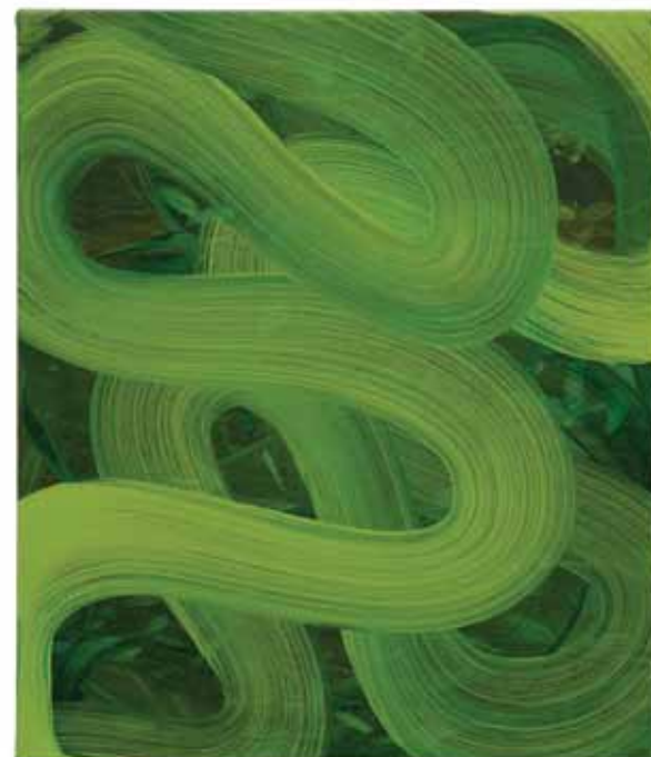
Pistachio Branches, 2016 Oil on canvas 35 x 30cm