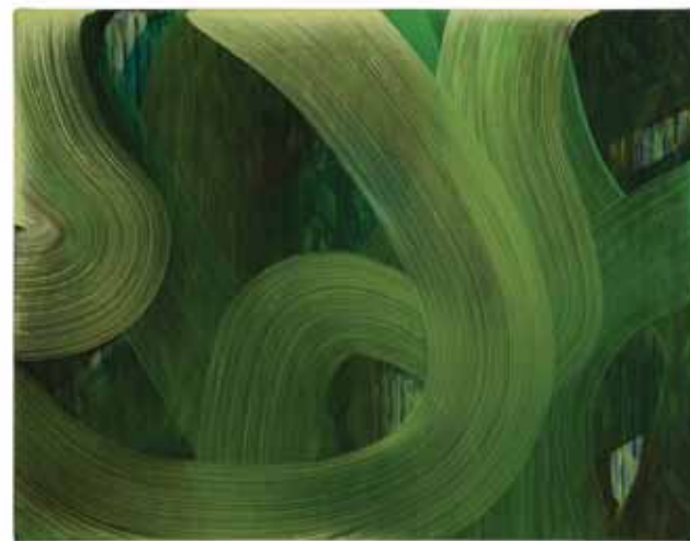
Untitled Tangle, 2015 Oil on canvas 35 x 45cm