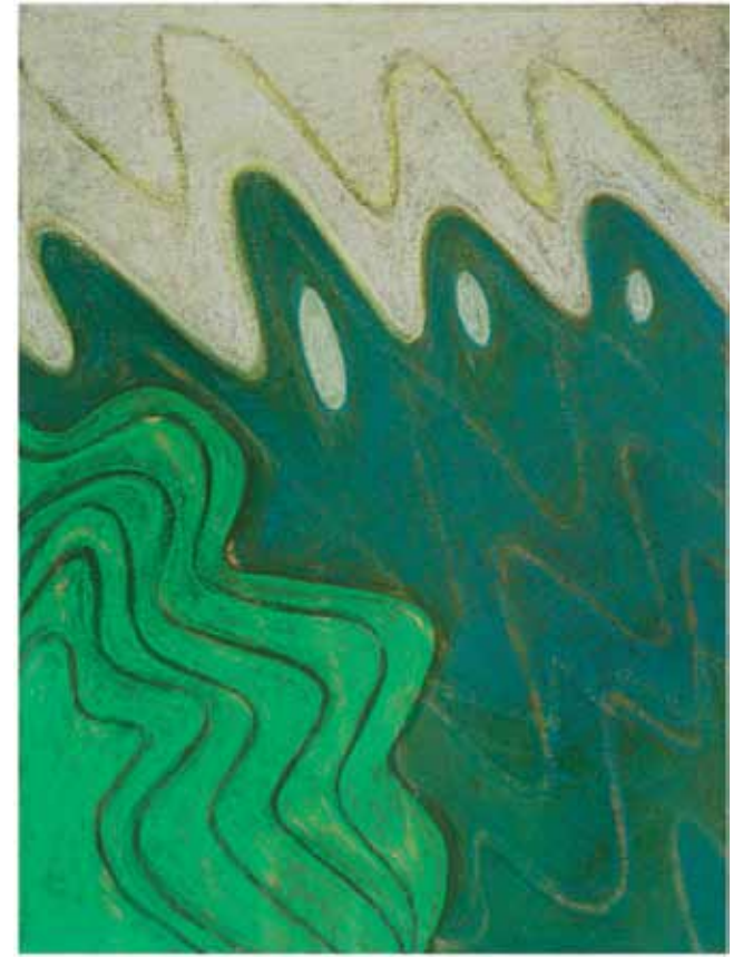
Formation 2, 2017 Pastel on paper 32 x 23.5cm