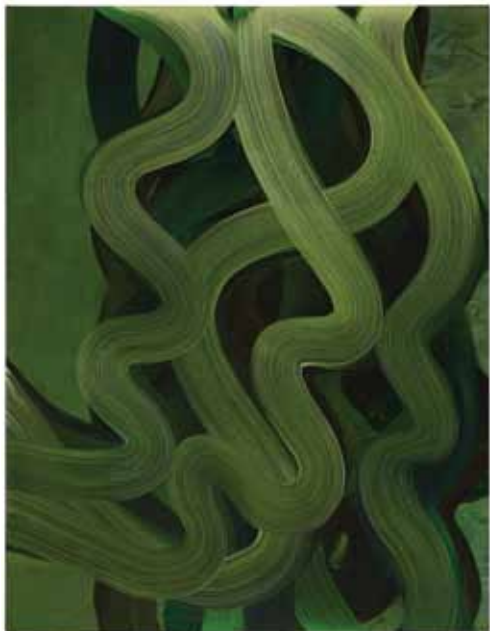
States of Green, 2015 Oil on canvas 130 x 110cm