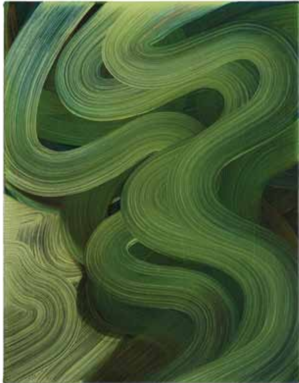
Who's Exploring Who? 2016 Oil on canvas 45 x 35cm